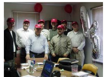
Members of UG leadership gather with IMA to celebrate the launch of V15 of the Desktop on June 30 th in Edison.

In addition to the party, we have also asked the participants to have their agencies serve as Beta test sites for the new software.