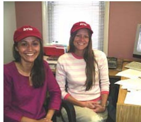
The new IMA uniform.

Do you have something you'd like to share with the IMA readership? Are you interested in seeing your agency up here?