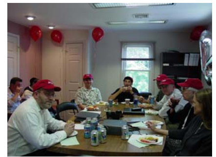
Lunch is served!

To celebrate this milestone and to show off its new features and functionalities, we scheduled a v15 Release Party and Demo on June 30 th at the IMA office. As your representatives, we invited the officers of the IMA UG and all members of the SIG to come see and celebrate with us.